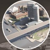
FLATS WEST BANK DEVELOPMENT