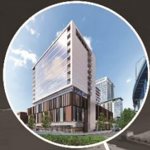
FLATS EAST BANK DEVELOPMENT