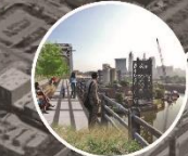
RED LINE GREENWAY