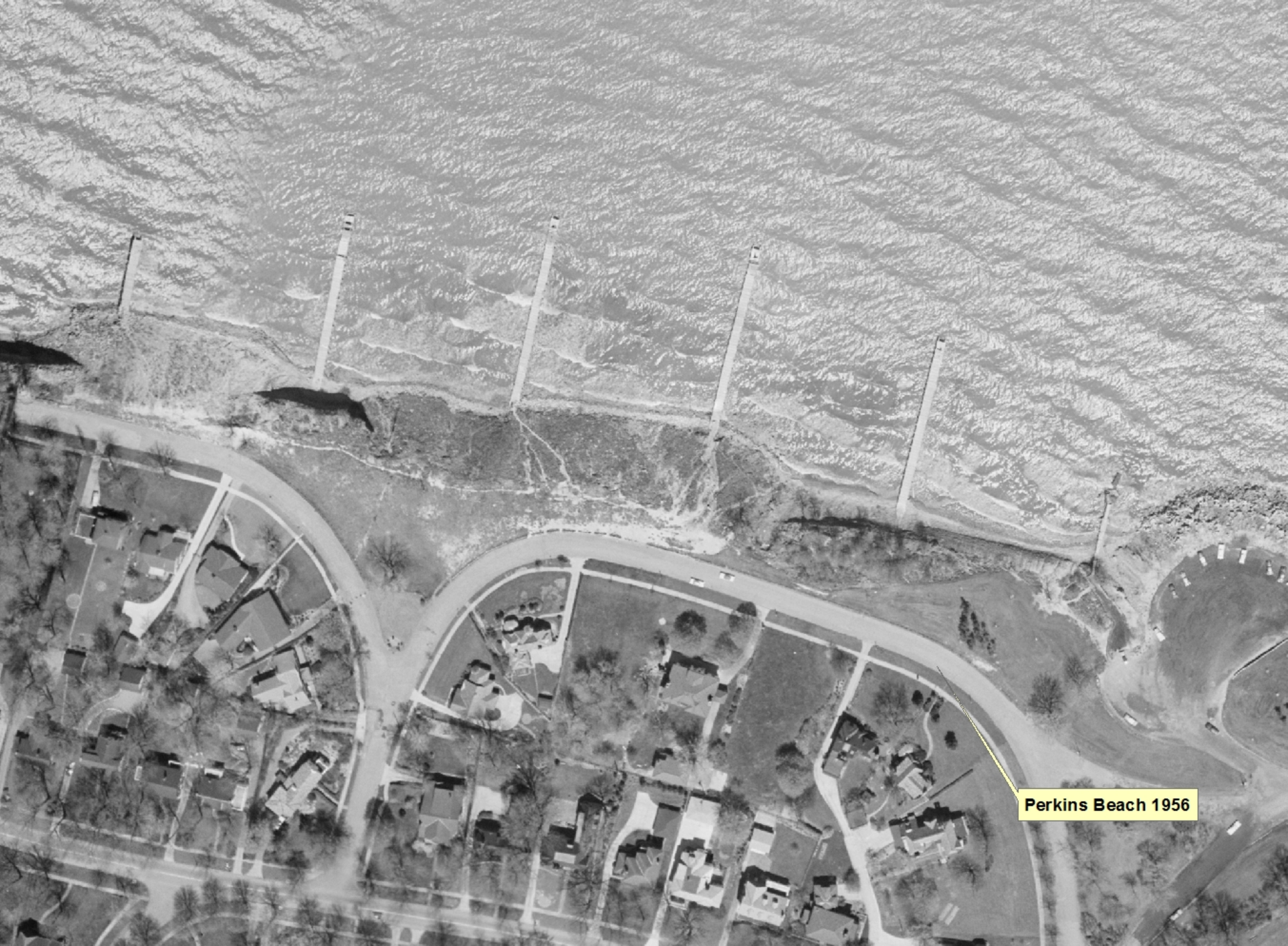
Perkins Beach 1956