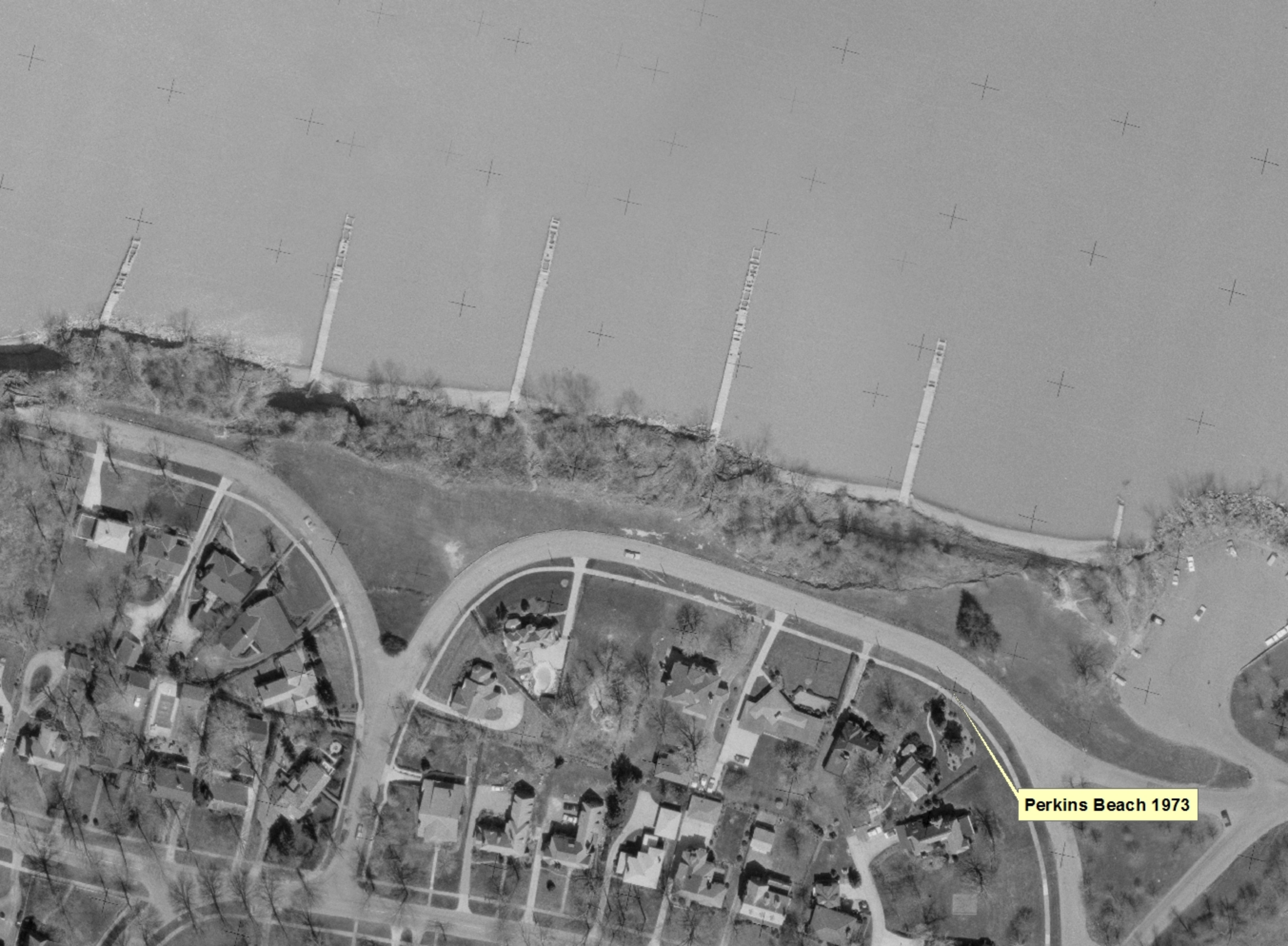
Perkins Beach 1973