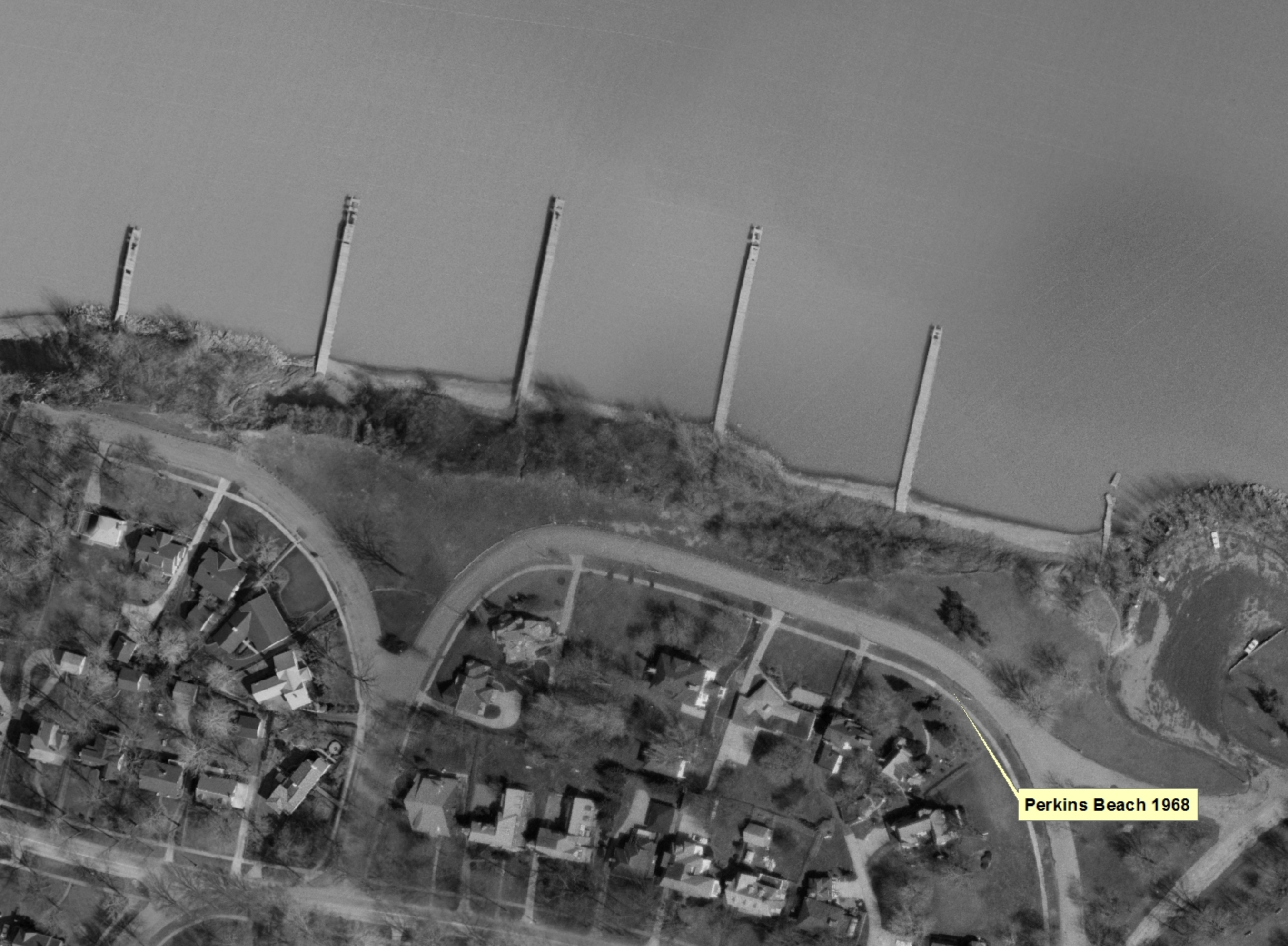
Perkins Beach 1968