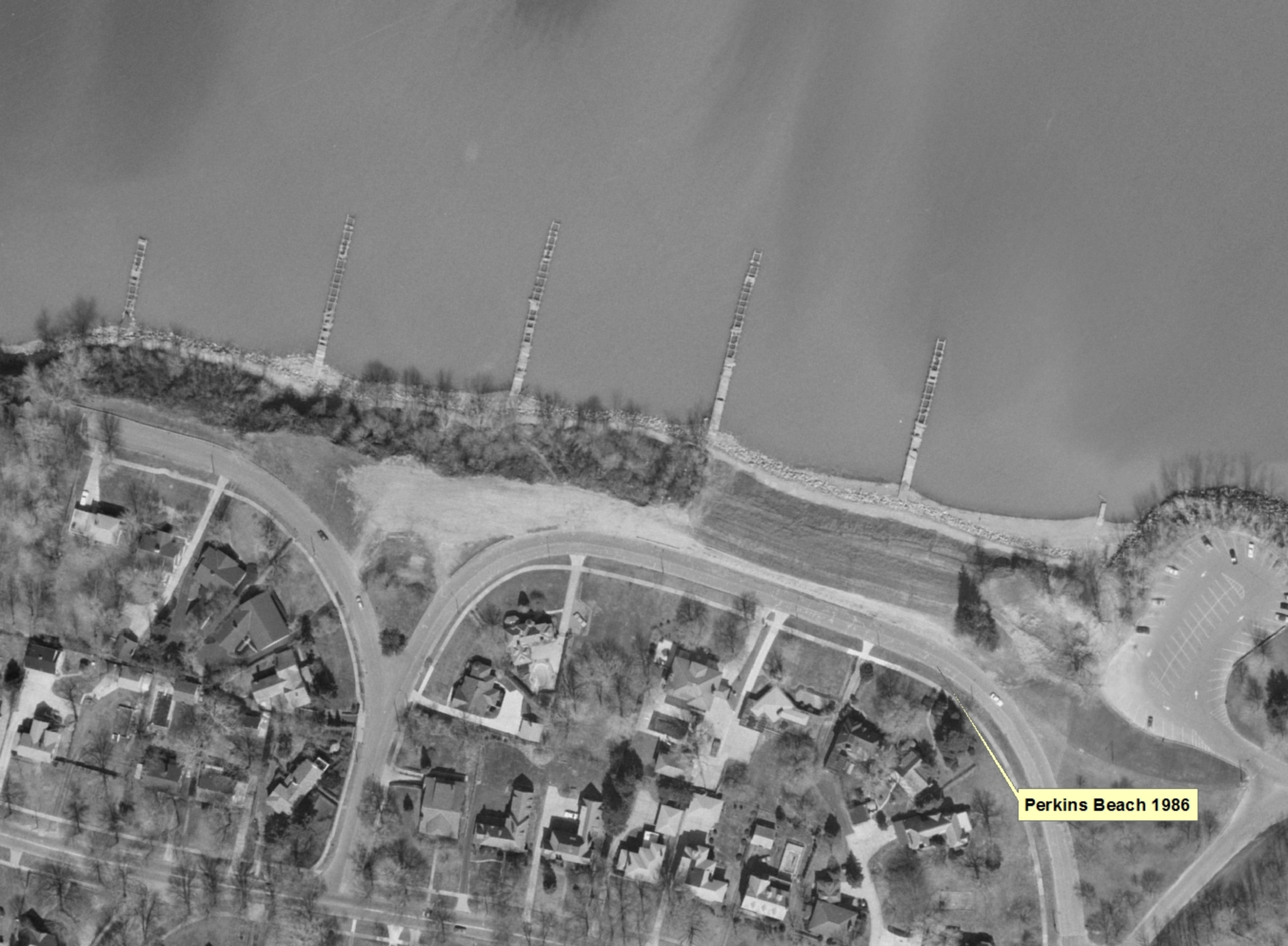
Perkins Beach 1986