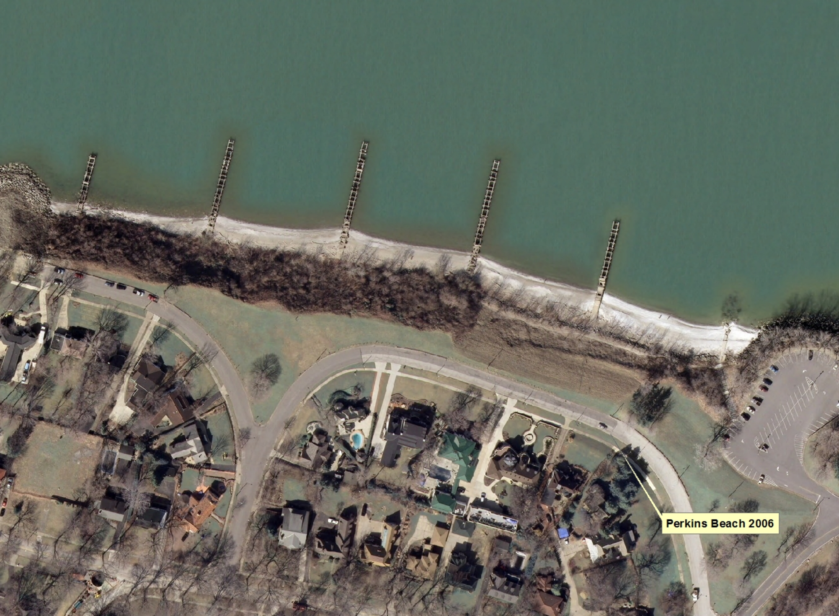
Perkins Beach 2006