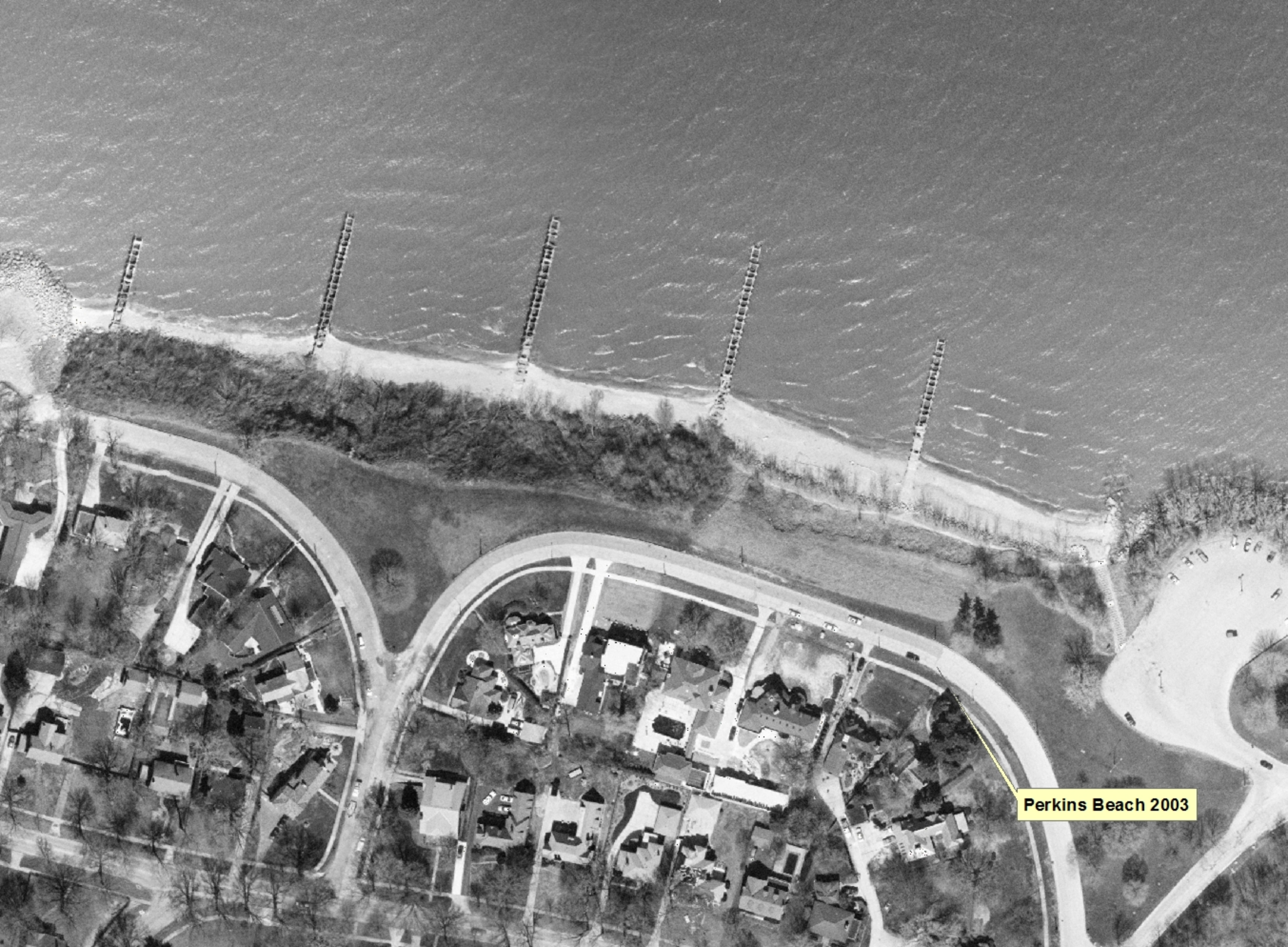
Perkins Beach 2003