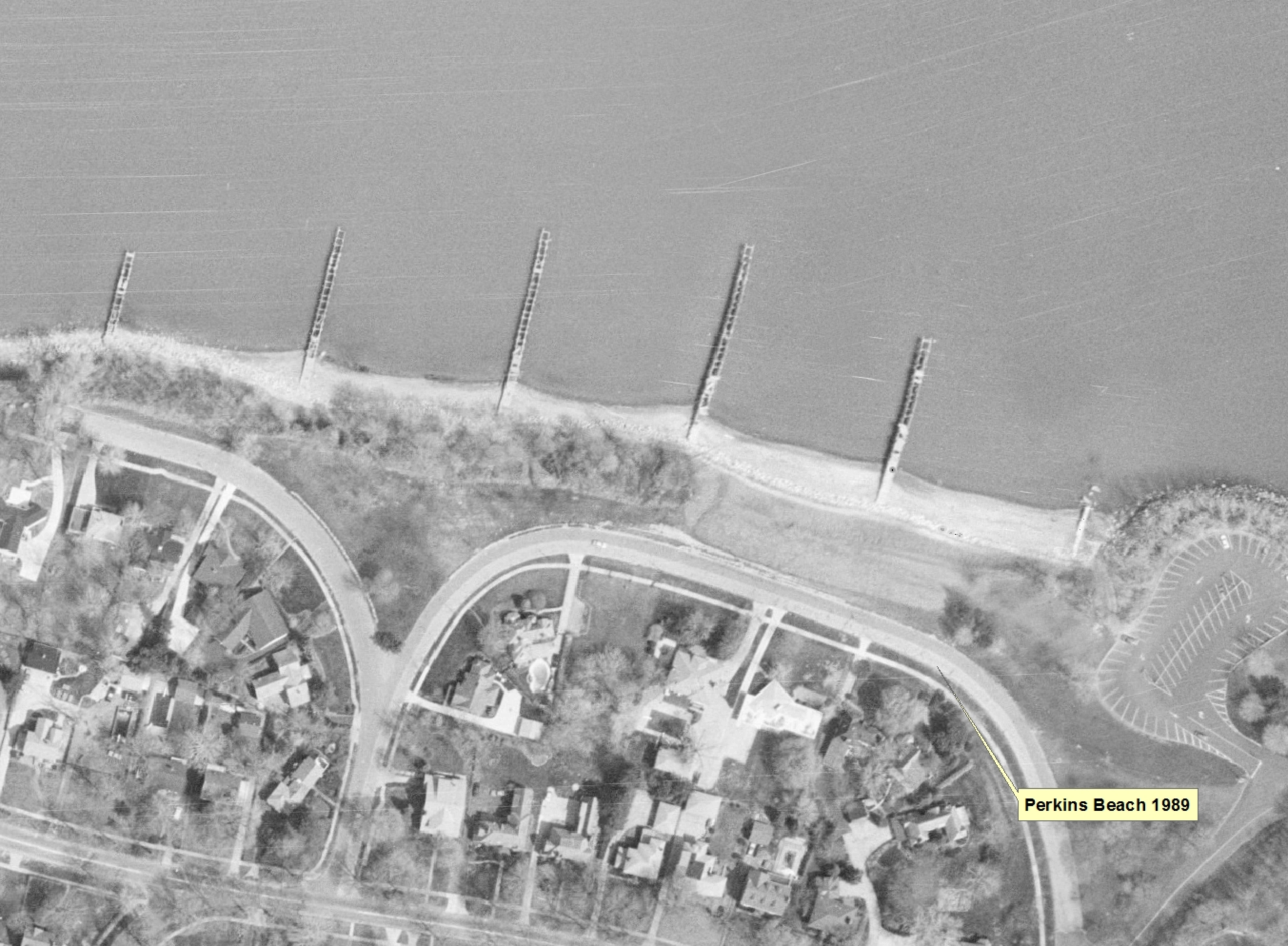
Perkins Beach 1989