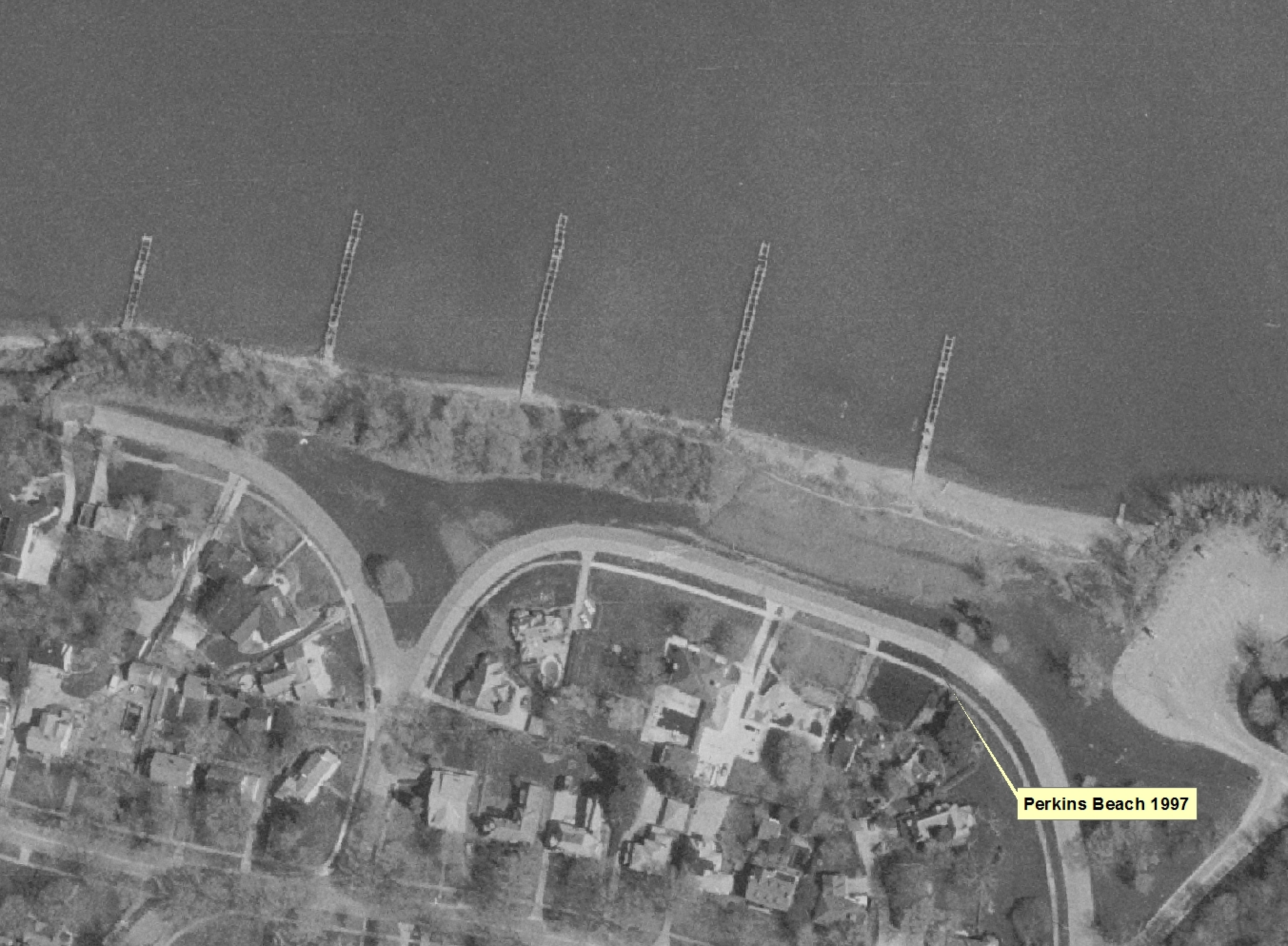
Perkins Beach 1997