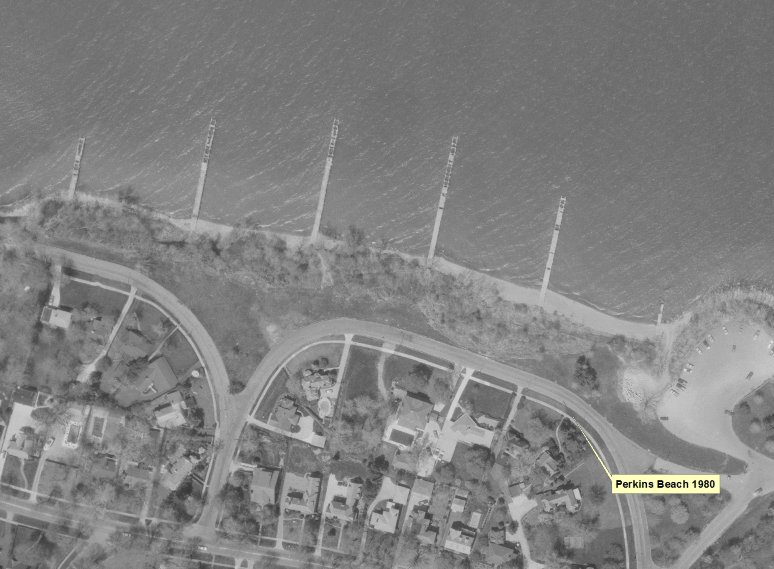
Perkins Beach 1980