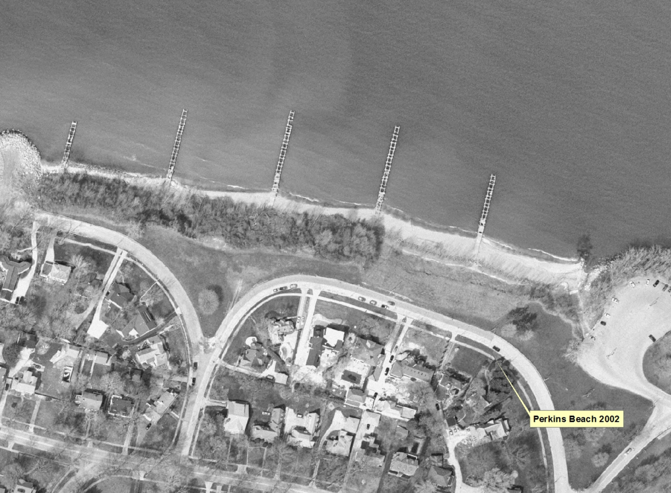
Perkins Beach 2002