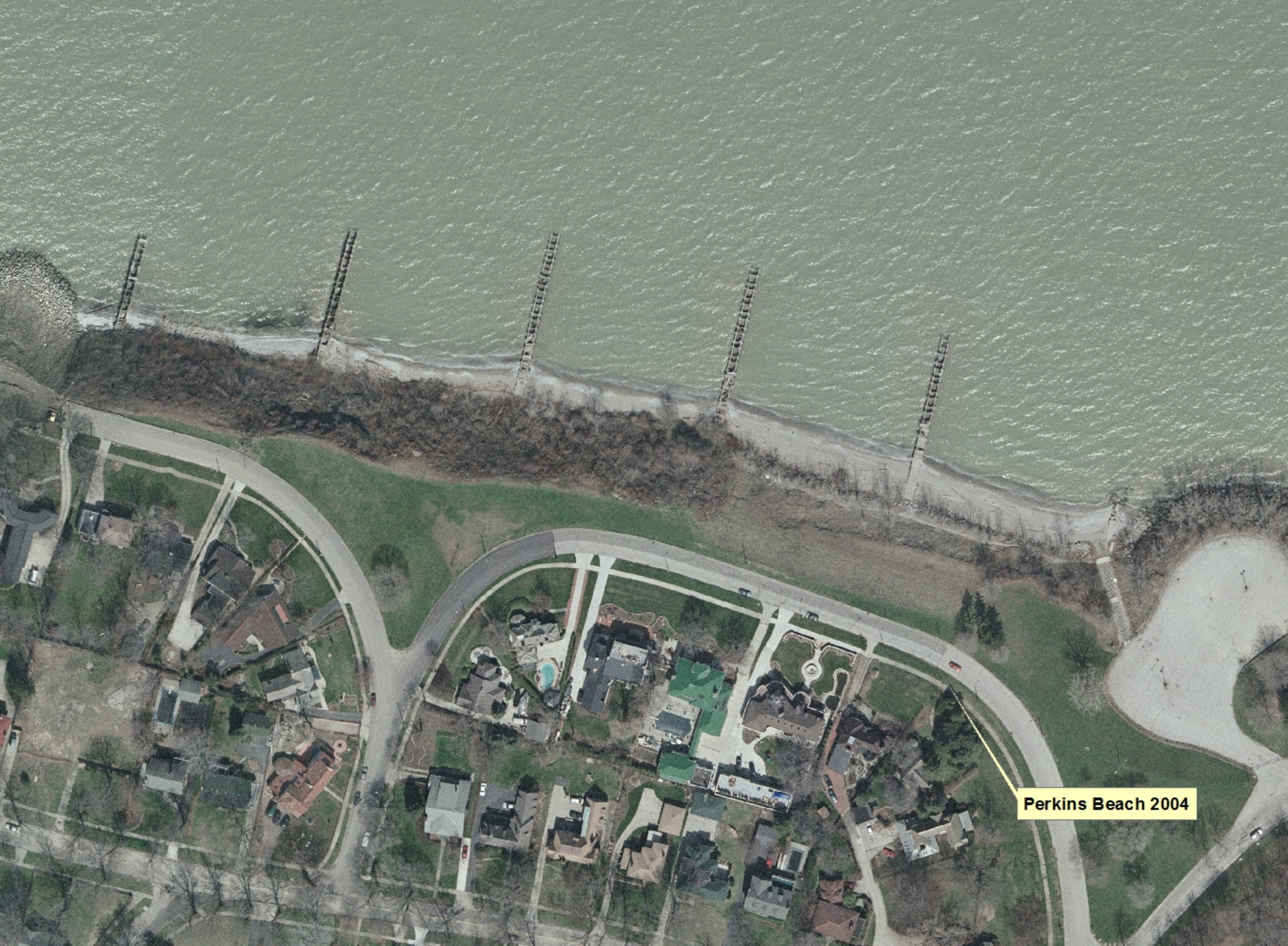
Perkins Beach 2004