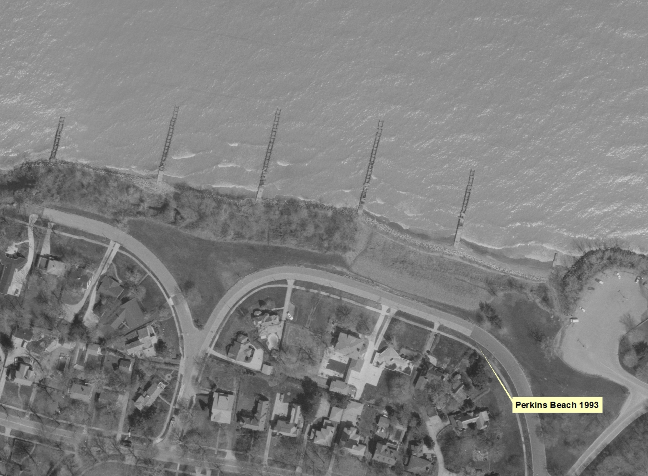
Perkins Beach 1993